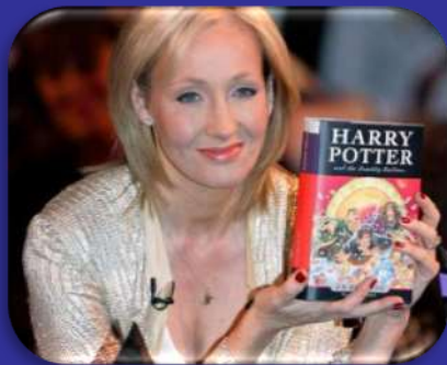
JK Rowling - French + Spanish