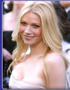
Gwyneth Paltrow - Spanish