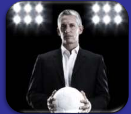
Gary Lineker - Spanish + Japanese