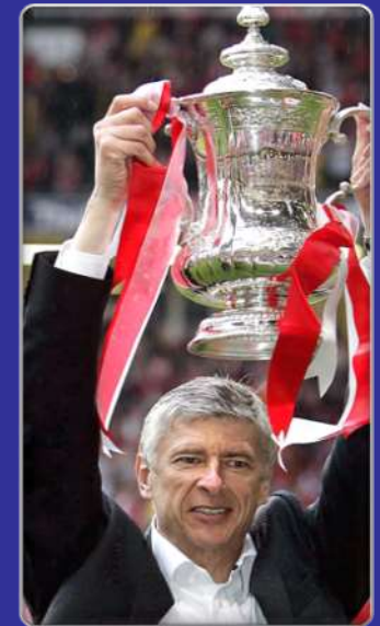
Arsène Wenger - English, Spanish, German